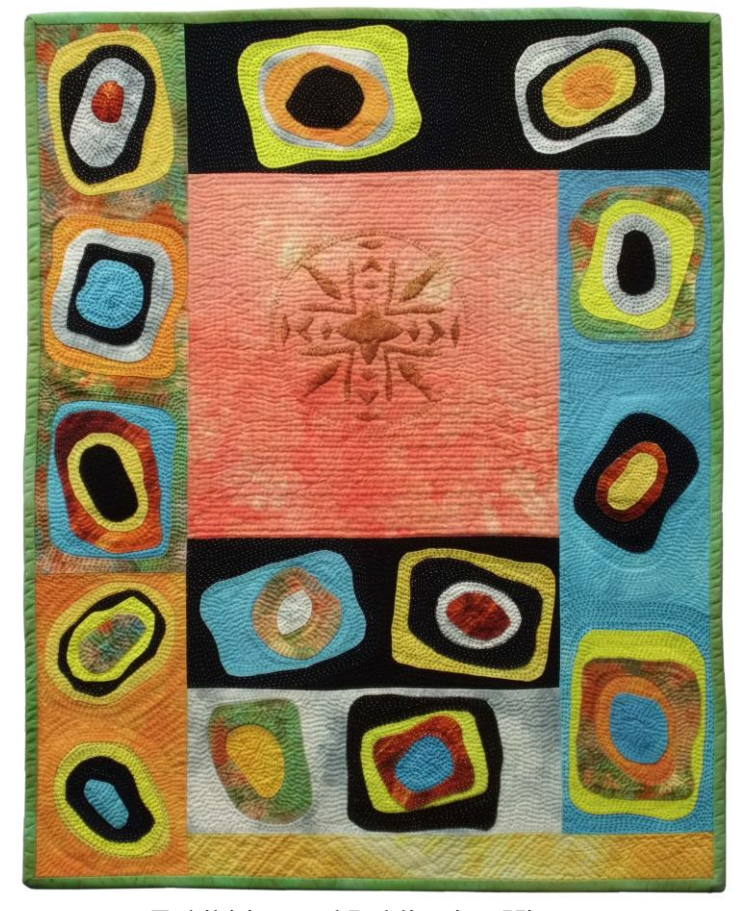
Exhibition and Publication History

(c) 2008-2014 Jean M. Judd/Artists Rights Society (ARS) New York Hand Stitched Thread on Hand Dyed Rust Pigmented Textile **Available for Purchase - $5.100**